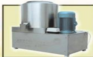
RAW MATERIAL MIXER