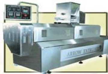
BREAD CRUMBS EXTRUSION MACHINE