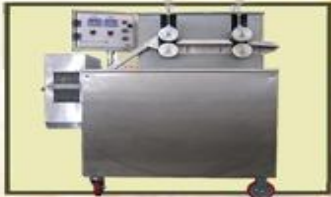
FORMING & DIAGONAL CUTTER