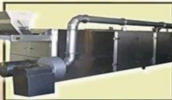
3 TIER MOISTURE OVEN DRYER