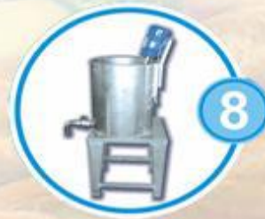
JACKETED OIL FLAVOURING MIXER