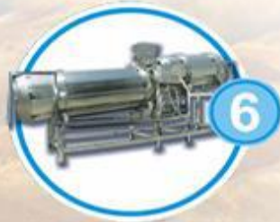
CONTINUOUS OIL SPRAYER COATING DRUM & CONTINUOUS SEASONING COATING DRUM