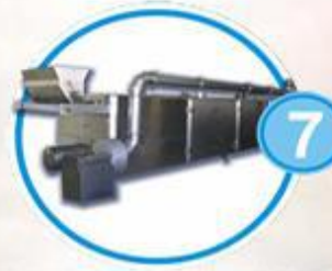
3 TIER MOISTURE OVEN DRYER