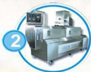
TOASTED PUFF EXTRUDER AS-TP150