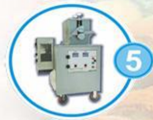
FORMING & DIAGONAL CUTTER