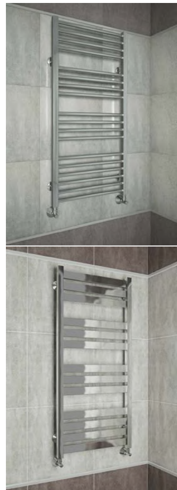
Pic. 2: Laser-welded towel radiator