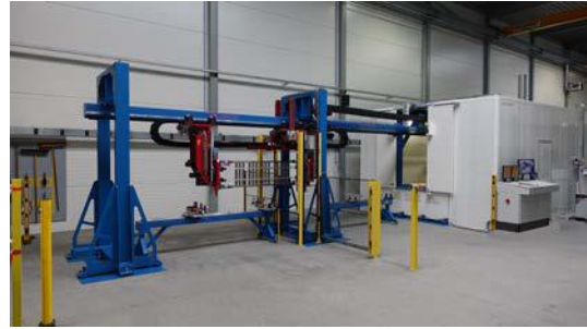
Pic. 3: System for welding different towel radiators

“My experience with Rofin’s Application staff was excellent. They were extremely knowledgeable, provided solid recommendations for process improvement, and were easy to work with,” reports Roel Doornebosch, Manager at Rodomach. Clamping the part and preventing warping were the main obstacles for this project as it is a key factor for successful welding results. With collaboration and “out of the box” thinking”, the team came up with a clever solution. Instead of using traditional clamp tooling, servo-controlled clamping with integrated cooling is utilized. This tooling method evenly clamps the part at all welding points and the cooling prevents the joints from warping.