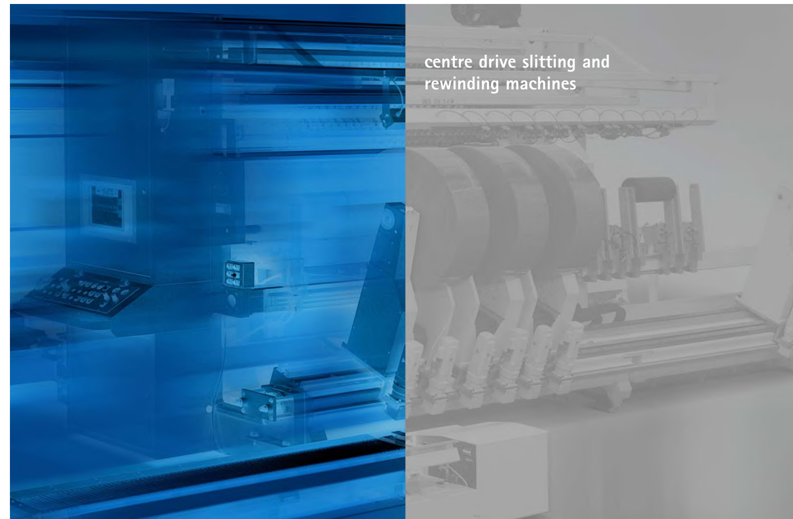
centre drive slitting and rewinding machines