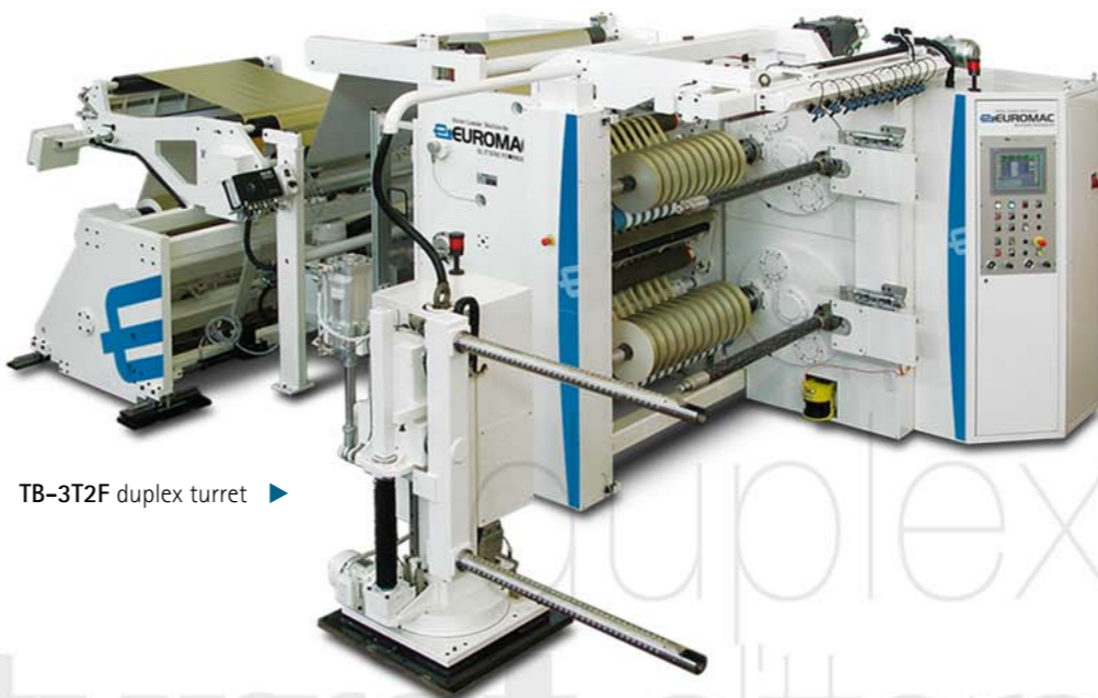
▶ TB-3T2F duplex turret

TB-3T2 series are Duplex Turret slitter rewinders specially designed for high production output, fast job changes and low downtimes. These machines feature automatic turret cycle with automatic transversal splice for job changeover time in less than 40 seconds.