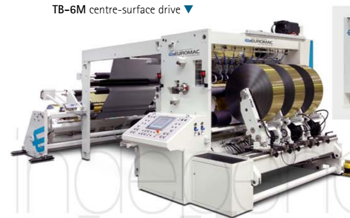
▼ TB-6M centre-surface drive