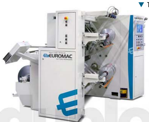
▼ TB-3i integrated unwinder