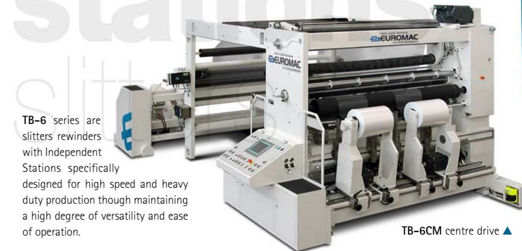
▲ TB-6CM centre drive

TB-6 series are slitters rewinders with Independent Stations specifically designed for high speed and heavy duty production though maintaining a high degree of versatility and ease of operation.