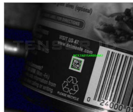
The system inspects both UPC and Data Matrix codes on the product labels.