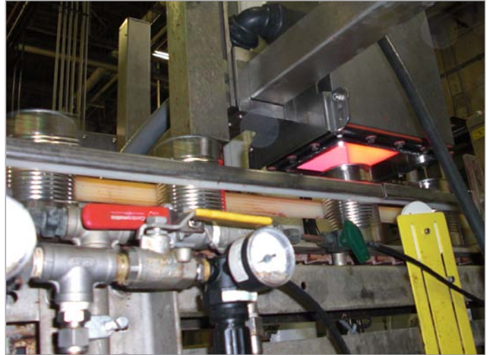
An enclosed camera positioned on a can seamer reads the variety code on the top of the cans.

Because there were not any off-the-shelf systems on the market to satisfy all of Del Monte’s requirements, Tensor ID designed, built, and implemented a completely custom system, including intuitive user screens that enable employees to run the system and initiate line changeovers with minimal training. Operators can view pass and fail counts, view current and last failed images, adjust inspection tolerances along with camera settings, and request remote support from Tensor ID.