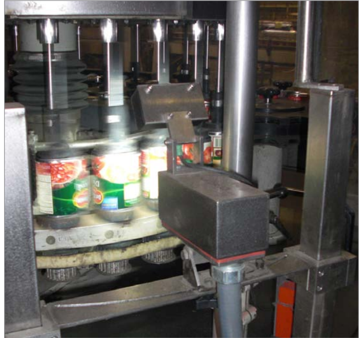
A camera reads the UPC code during the labeling process.

With the new system implemented, Del Monte can be sure that its canned fruits and vegetables are meeting the high standard of quality that has become synonymous with the Del Monte name. Gary Short, Distribution Supervisor at Del Monte, commented on the improved accuracy in their processes, which has ensured peace of mind for the company: "This system has met all of Del Monte's demands for an automated inspection system that assures the correct label and packaging is being applied onto the correct brite cans. Since Del Monte Foods has installed this system on our high-speed label/packaging line, we have not received any customer complaints for mislabeled product. How great is that to know your customers are always getting exactly what they expect!"