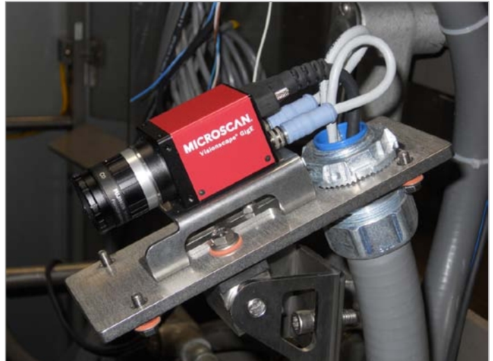
Microscan's Visionscape software supports up to eight camera inspection points per system.