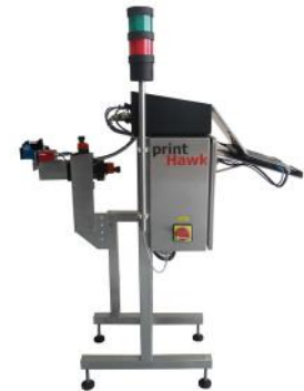
The printHawk solution includes a printer, the Vision HAWK smart camera with AutoVISION software, and a rejection system.