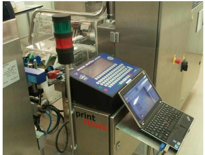
Data and print quality are inspected by Elchema's printHawk solution using the Vision HAWK smart camera and AutoVISION machine vision software from Microscan.

The mission of Boehringer Ingelheim can be summed up in a single phrase: value through innovation . Always at the forefront of innovation, the company decided to implement a state-of-the-art solution for ensuring that their products not only meet, but exceed these new requirements.