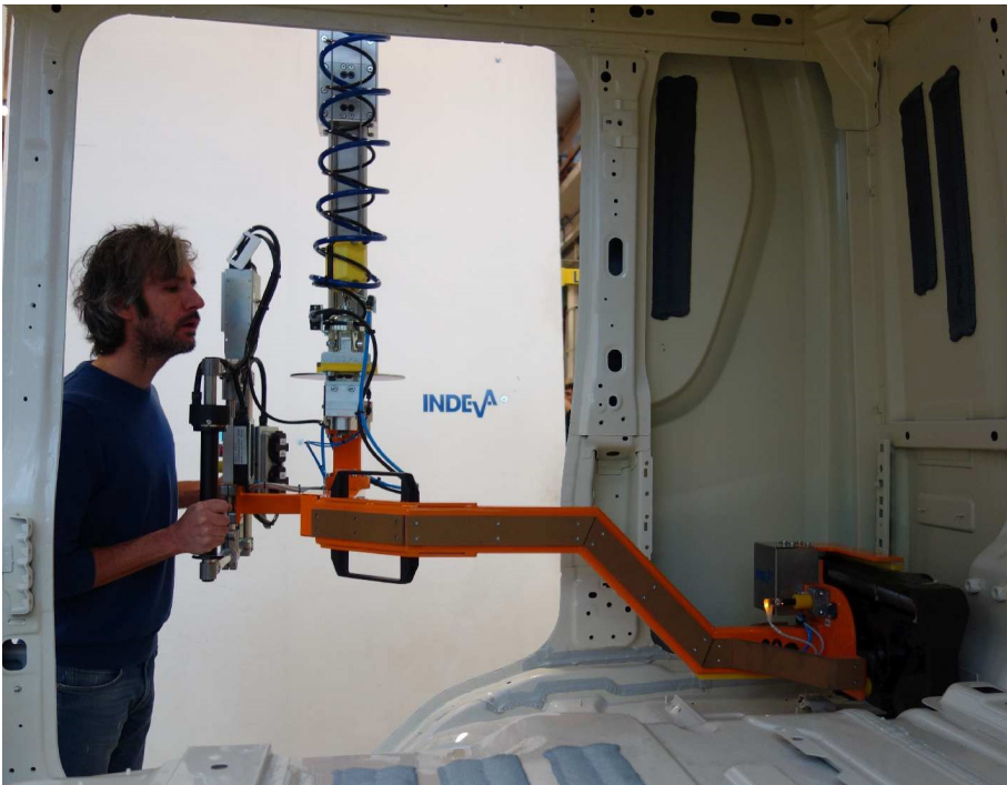
This document is property of Scaglia INDEVA S.p.A.; any partial or full reproduction without written authorization by the owner is prohibited.