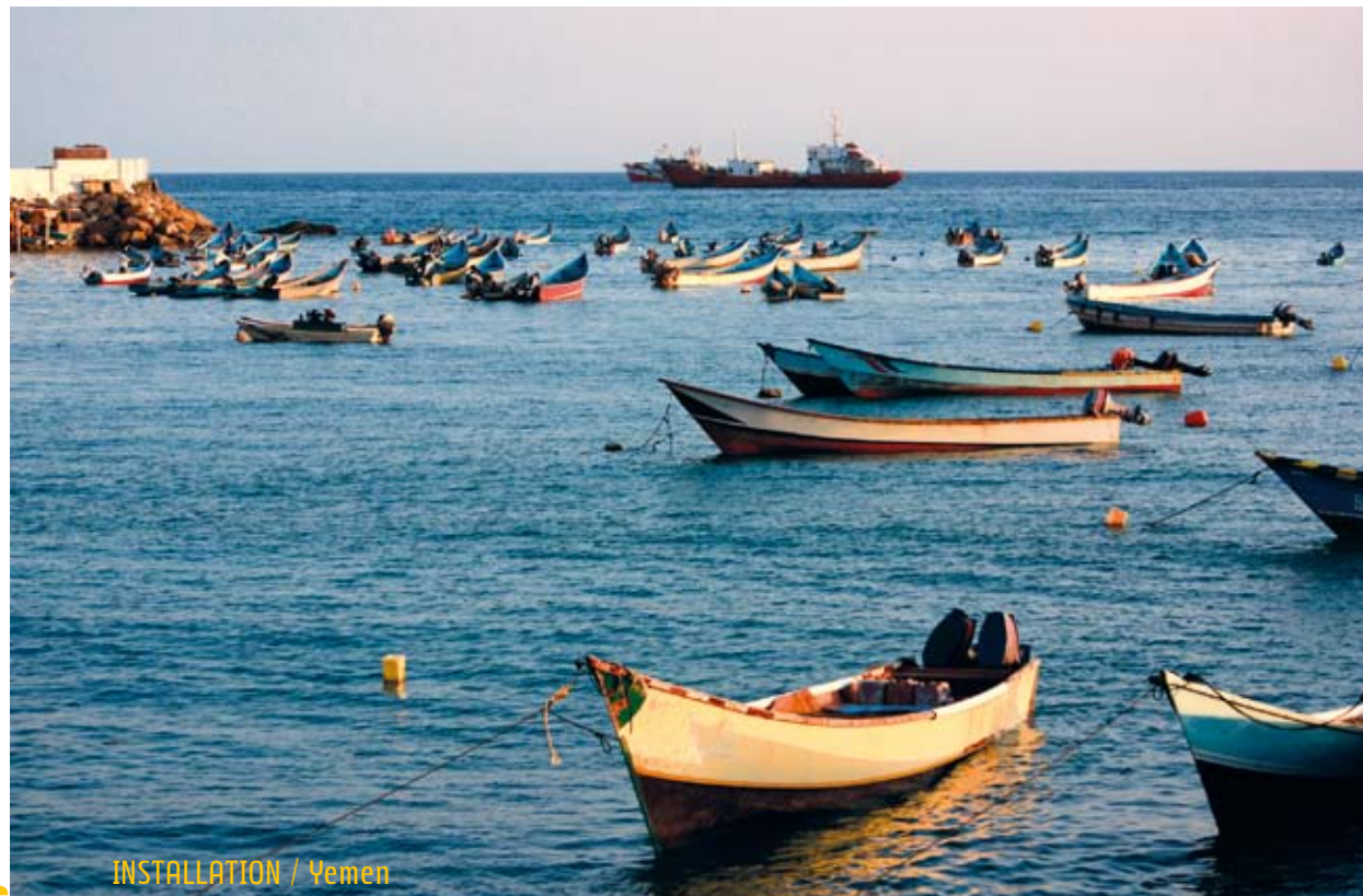
INSTALLATION / Yemen