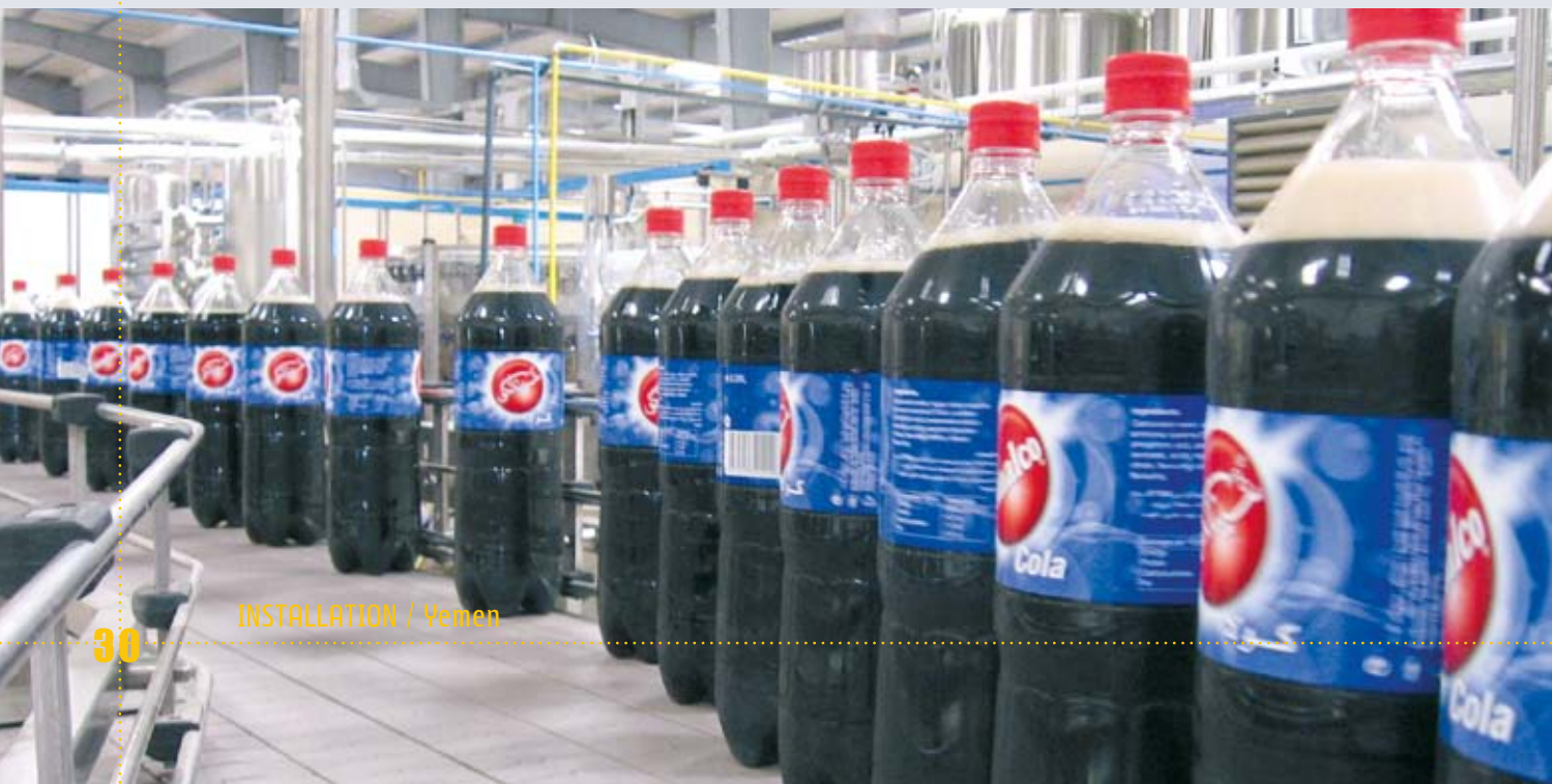
INSTALLATION / Yemen

by Smimec, another company of the SMI Group, using a sophisticated FMS production line consisting of 12 CNC machining centers. These are technologically advanced, fully automated machine tools, which work 24/24, 7 days a week, even unmanned.