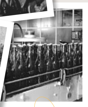
Laboratorio della Galvanina